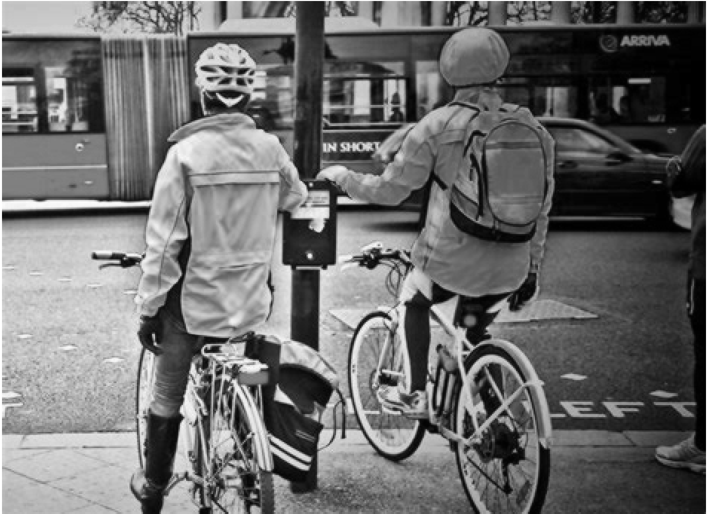
image can withstand the assault of the ensemble, they are perfectly free to seek other employment. Should they wish to endure the damage to their semiotic belief structure, they do it for the money. It is a well established exchange, in return for attendance in compliant livery, every hour spent observing the requirement equates to coin in the hand.

In direct contrast to this well established trade off, we now see a dramatic upturn in the number of people who believe that their personal choice of clothing lends some form of authority to their being. At the traffic lights in any busy town or city, regular couture catastrophes occur in the form of cyclists wearing high viz garments while waiting for the traffic to move on. The variance in cyclist apparel is highly informative. Generally speaking nobody wearing high viz ever admits to skipping the lights or cycling across the central reservation doing a wheelie. Their obsession with the perceived authority of their garments prevent them from being seen to abandon convention. Upon witnessing any other cyclists flouting the highway code, these self appointed high viz vigilantes will invariably show disapproval and possibly utter some trite soundbyte to do with such behavior being 'against the law'. It seems highly unlikely that these pedants actually live their life according to the scriptures and probably engage in just as many unconventional practices as their impatient targets. In fact, a quick perusal of Youtube on this subject produces a substantial amount of high viz wearing traffic infractions.