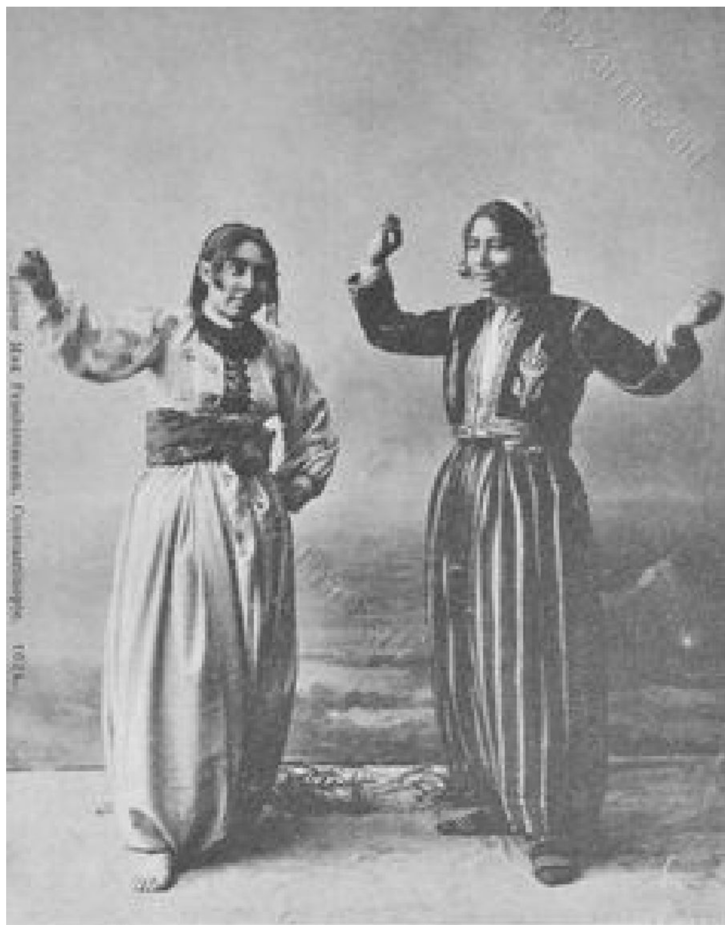
Danse des Telganes.